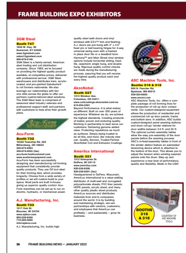
January: Frame Building Expo Preview – Exhibitors & Products