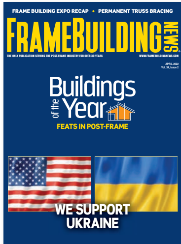
April: Frame Building News Buildings of the Year