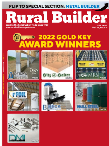
July: Gold Key Awards