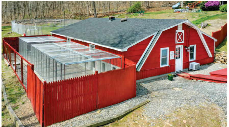
Dog kennelling facility in Connecticut.

The demand for purpose-built animal structures has grown dramatically since I first began building chicken coops with The Hen House Collection. Since starting my businesses, I've noticed that customers are looking for custom-designed shelters for their animals that cater to their unique needs, not just a generic new or renovated shed. For every animal, there are different needs that must be met. For example, dogs and chickens bring