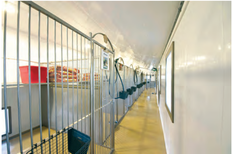
Smooth, sealed floors and walls that resist moisture and won't trap dirt.

Using sheds as the base foundation for these projects can be hazardous for animals if you don't know what you're doing. General-purpose sheds will rarely meet the requirements for an animal shelter. It's important to note that manufactured sheds are designed for static storage, not for housing living animals, and frequently lack proper ventilation and sanitation. Overlooking these renovation needs can lead to complications such as poor air quality, moisture buildup, and unsafe surfaces, which can all result in injury to your shelter and animals if not addressed, especially without animal-friendly materials. However, you can convert these generic sheds for pets if you take the right steps. When making such adjustments, builders should rework the wall structure to improve airflow, upgrade the flooring to withstand repeated moisture exposure, and reinforce the doors and hardware to