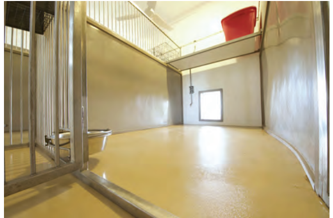
Smooth, sealed floors and walls that resist moisture and won't trap dirt.

Proper cleaning and disinfection minimize pathogen load, reduce pest populations, limit zoonotic disease transmission to humans, and improve livestock productivity. Install smooth, sealed floors and walls that resist moisture and won't trap in dirt, such as epoxy moisture barriers and coatings. Sheet vinyl is also an excellent choice for damp areas that are prone to moisture buildup.